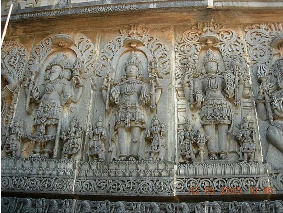
An art depiction of the Trimūrti at the Hoysaleswara temple in Halebidu. Trimūrti is the Hindu trinity deity with members Brahma, Vishnu and Shiva. [23]