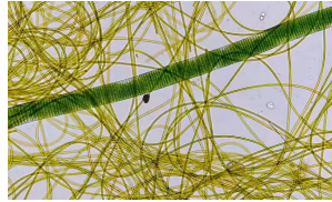
Filamentous cyanobacteria (200x)